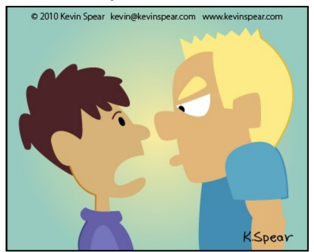
"Why don't you channel your aggressive energy to something constructive; like football, rugby or macrame?"